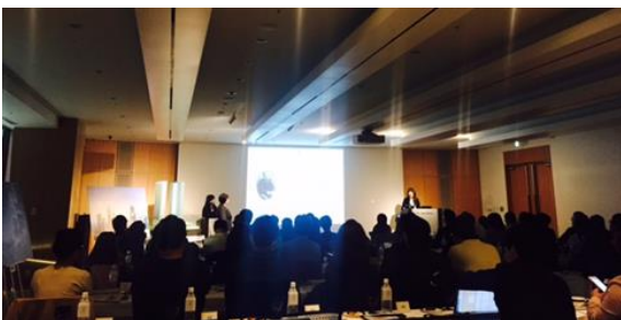
At the seminar