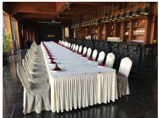
~ venue ②~