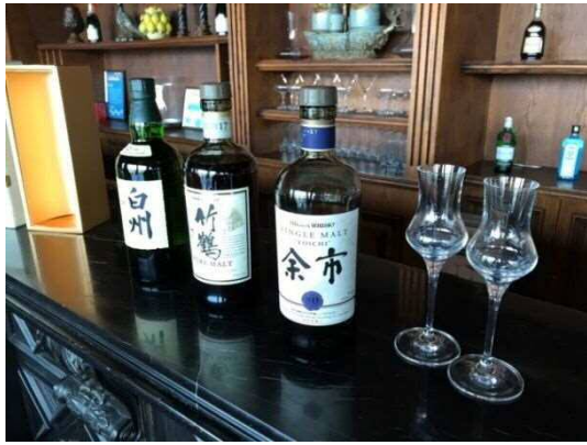
~ Japanese whiskey tasting service ~