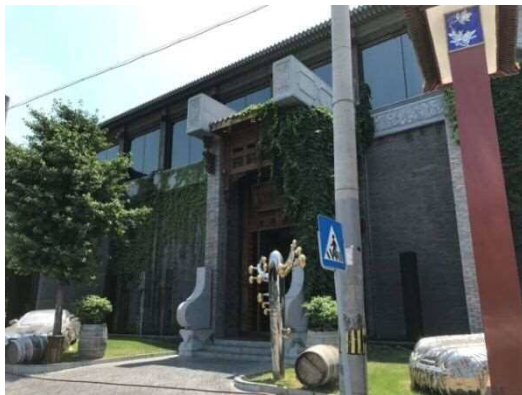
~ venue ①~

We will definitely keep following up on specific requests by the High-Net-Worth individuals, and build up alliance further with the executives in wealth management business, in order to promote real estate investment and resort project in Hokkaido in the future.